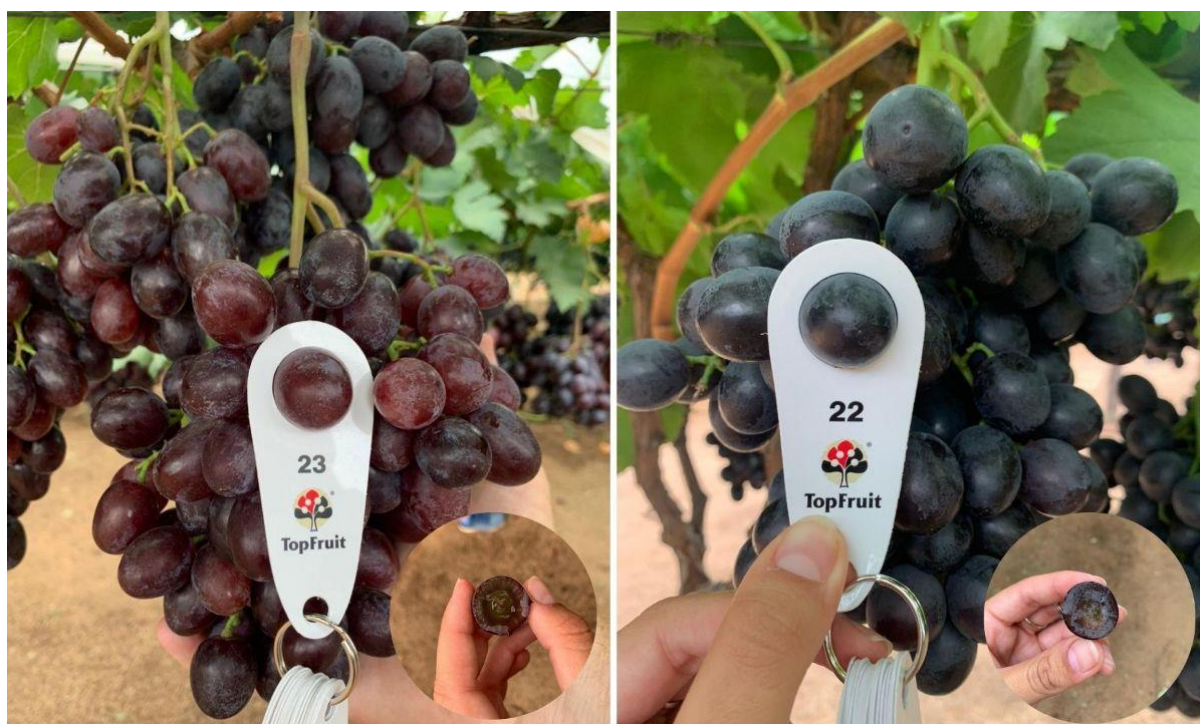
ARR 13 & ARR 14. Commercial plantations of these two varieties grow mainly in South Africa and Namibia due to their suitability to the climate.

Two more varieties caught the attention of the participants: ARR 13 (ARR Passion Star™) and ARR 14 (ARR Mystic Bloom™). These two varieties perform exceptionally well in South Africa and Namibia. ARR 14 amazed everyone with its extremely grower-friendly, high-yielding vineyards planted in the Limpopo region. No Ethephon was applied for color.