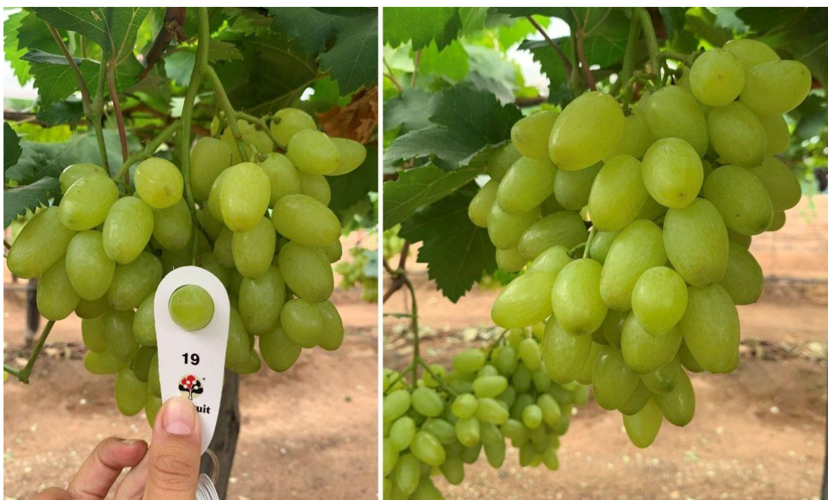
ARRA 30 (ARRA Sugar Drop™)

The team had the opportunity to elaborate more on the aim of the ARRA™ varieties in this region and gave the growers the assurance of technical support through the year. The climate in this region dictates that grape varieties must have a certain resistance to rain, a characteristic that is undoubtedly an advantage of the ARRA Varieties range. The region's annual rainfall is high during the harvest season, and the month before this field day, amounting to approximately 85mm of rain in the area of this test block giving ARRA varieties the opportunity to show their mettle in local conditions.