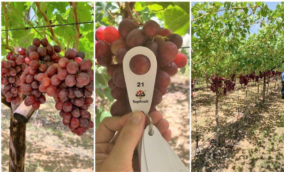
Ready for harvest ARRA 29 at Shelfco Farm.

The day continued with the tour at Sweet Sensation farm, situated in the northern region of South Africa. The field days in the northern region allowed the TopFruit team to showcase the commercially planted varieties, as well as to introduce the promising ARRA selections in the test blocks.