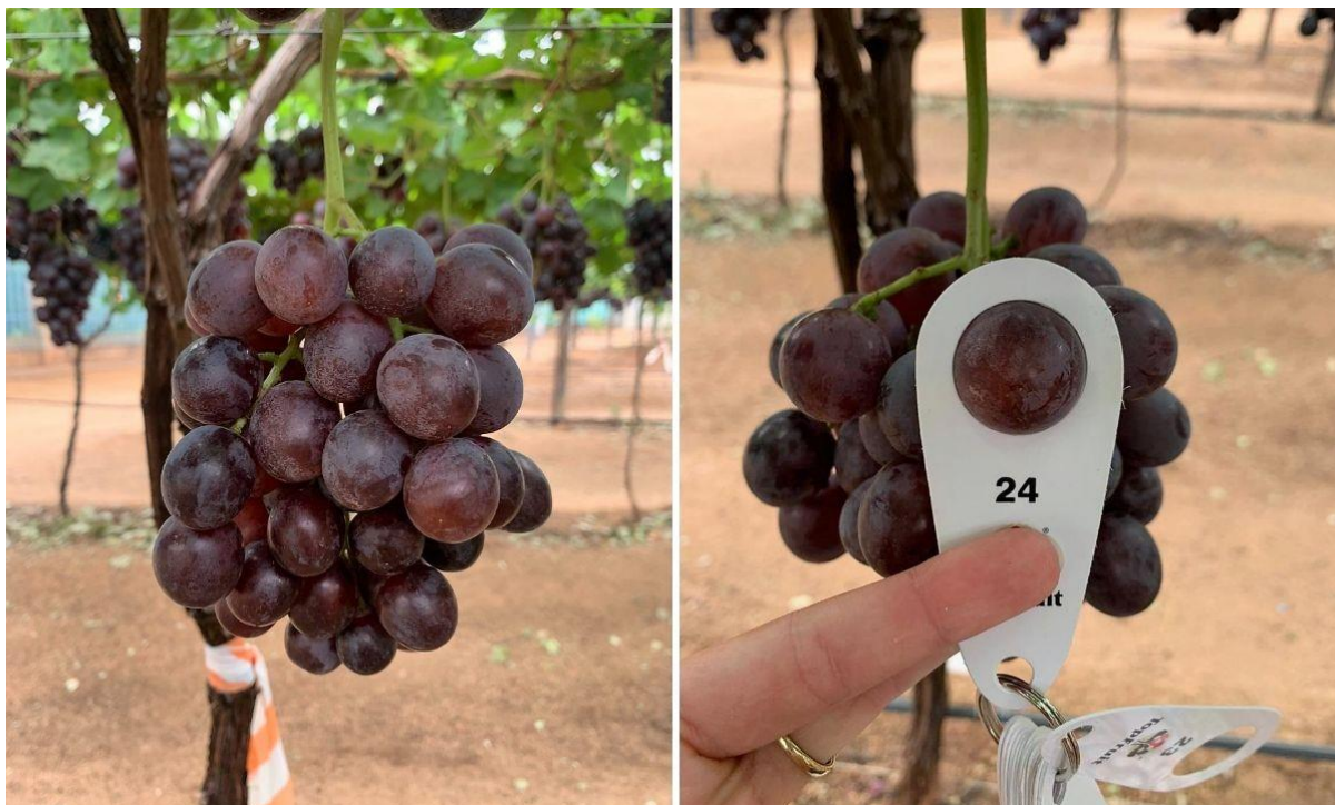
ARR 29 beautiful results with large, crisp berries and intense color with no Ethephon.

Two more varieties caught the attention of the participants: ARR 13 (ARR Passion Star™) and ARR 14 (ARR Mystic Bloom™). These two varieties perform exceptionally well in South Africa and Namibia. ARR 14 amazed everyone with its extremely grower-friendly, high-yielding vineyards planted in the Limpopo region. No Ethephon was applied for color.