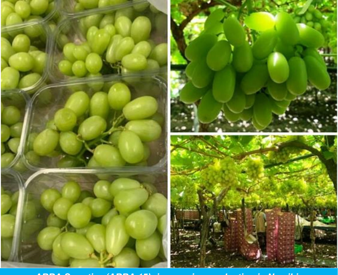
ARRA Sweeties (ARRA 15); impressive production in Namibia