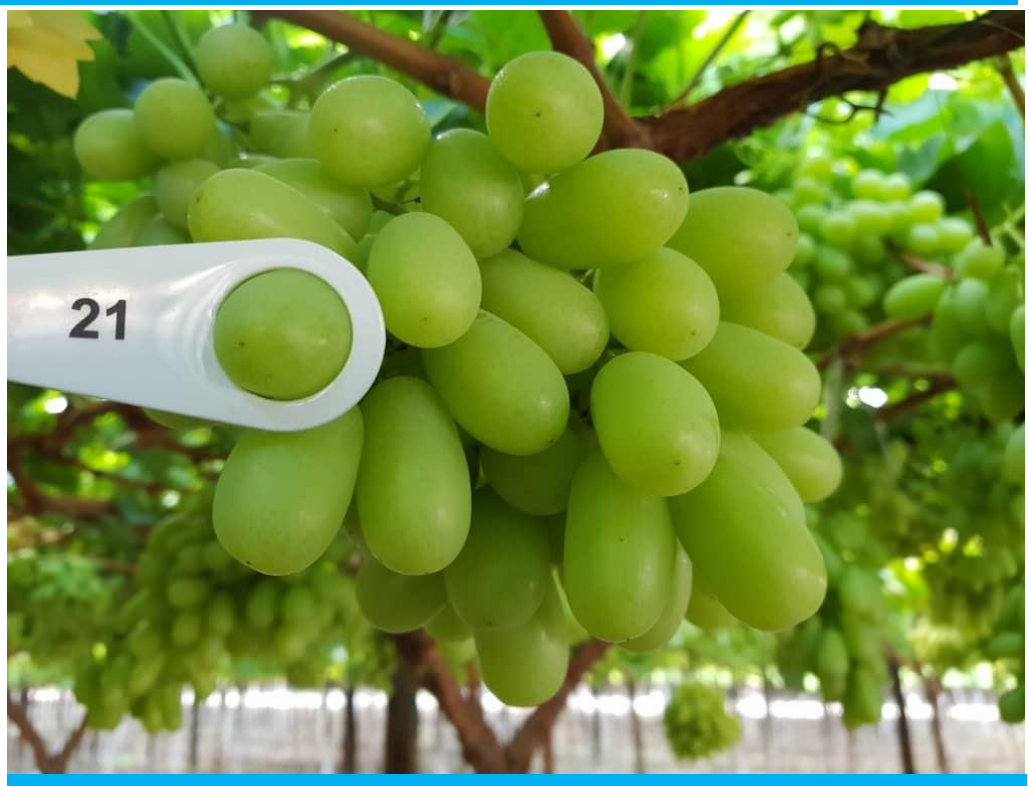
ARRA Sweeties™ (ARRA 15)