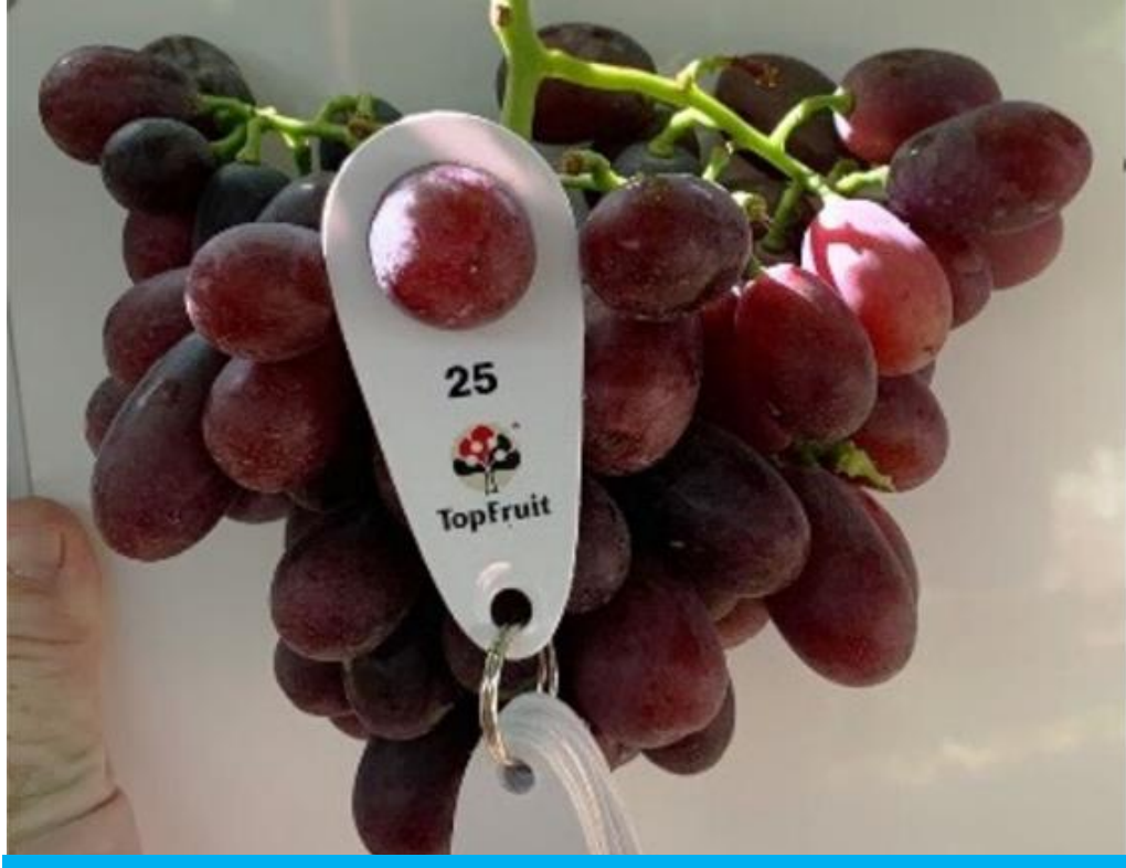
ARRA Passion Star™_(ARRA 13) achieved a very impressive size