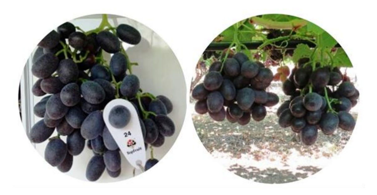
ARRA Mystic Bloom (ARRA 14) thriving in South Africa

The growers in Western Cape are becoming aware of the advantages of the ARRA varieties, with large amounts of ARRA Passion Fire (ARRA 29) being ordered for planting. In 2019, ARRA Passion Fire plantations amounted to more than 150 hectares in total, and this number is still growing due to continued ordering and demand to increase plantation.