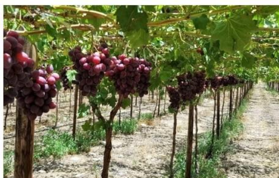
ARRA 29; Duikerskloof Farm