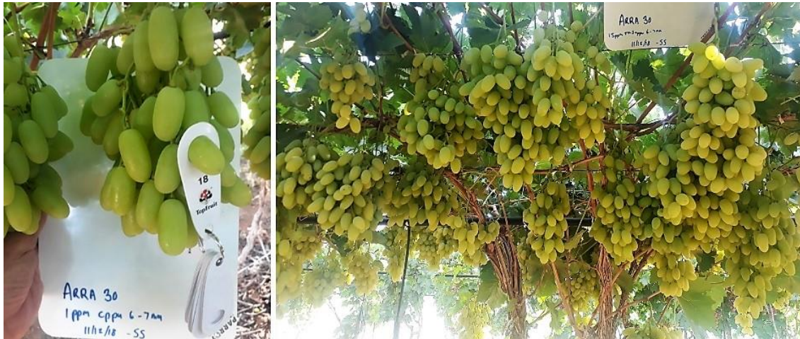
ARRA 30; Sweet Sensation Farm, trial block

Following Grapa's experience in California in 2018, The Sweet Sensation farm did a very important trial on one of the ARRA 30 sections; they applied 1ppm CPPU on 6-7 mm berry size, It worked the best out of all the protocols, especially on the berry attachment. Stephan Nel applied the same protocol in TopFruit's test block at Simondium and soon we'll be able to see the results.