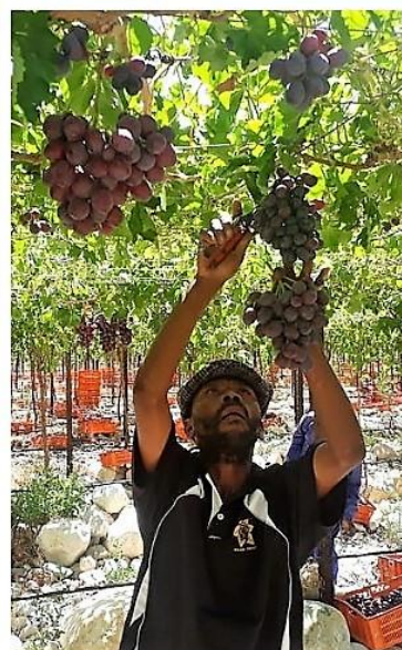
ARR 29 harvest; Hex River Valley