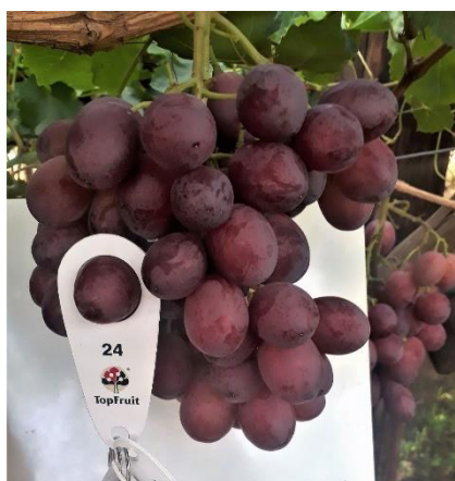
ARRA 29; Sweet Sensation Farm, trial block