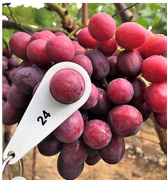
ARR 29; Cairngorm, Cape Orchard Company