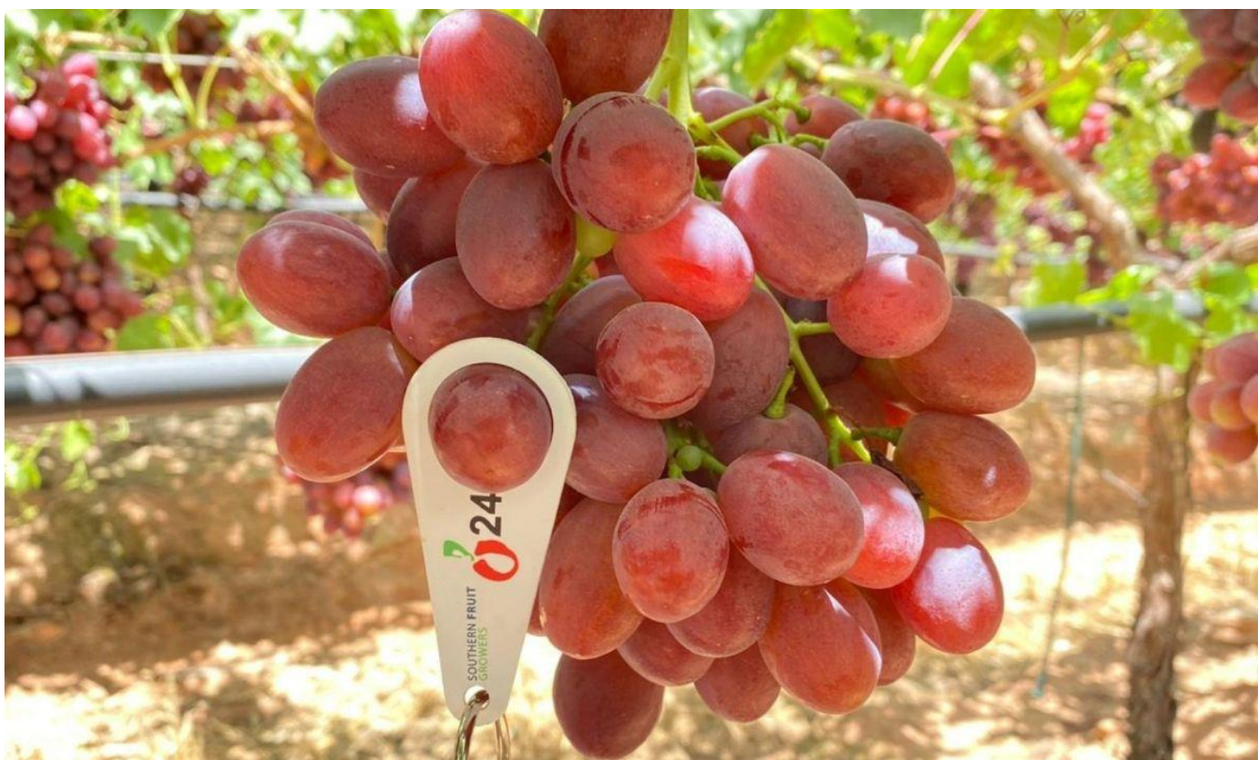
Excellent ARRA 29 at Southern Fruit Growers.