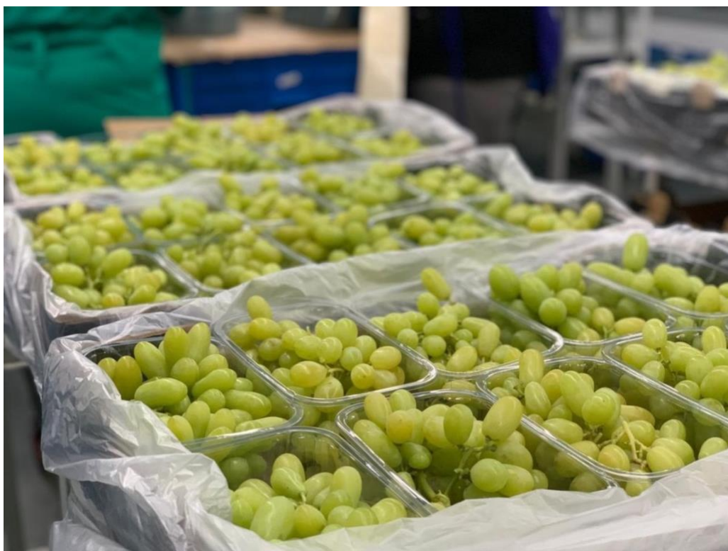
ARRA Sweeties punets packed by Consortium Fruit.

Mr. Jordan concludes: "We harvest in the early mornings from about 02:00, to ensure that the grapes are in the packhouse by 07:00. This is done when temperatures are low so that we can ensure quality. The Brix at harvest was between 17 and 20 and the average size between 19 and 22. We have now planted ARRA 29 and we are looking at some of the other ARRA varieties as well."