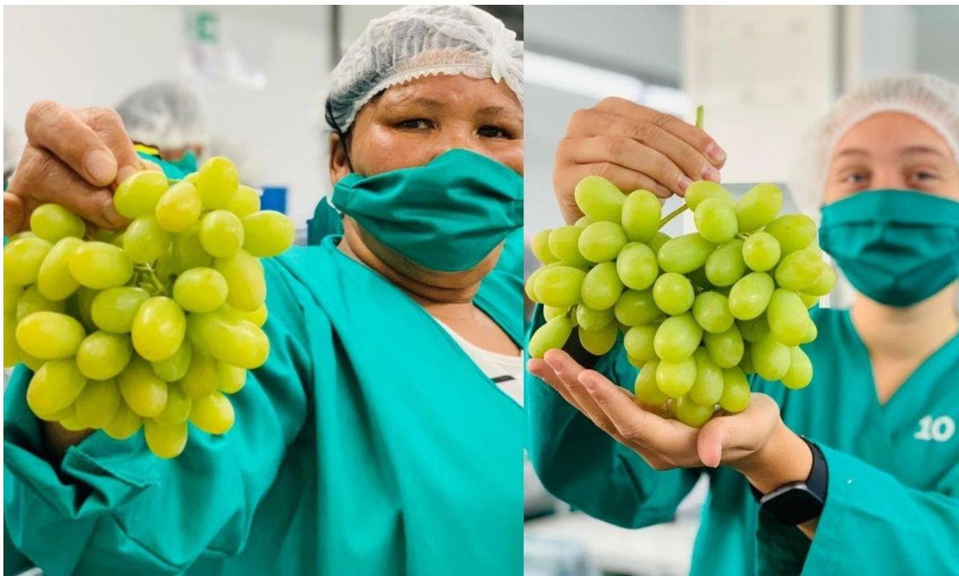
ARRA Sweeties™ in all its beauty.

Mr. Jordan concludes: "We harvest in the early mornings from about 02:00, to ensure that the grapes are in the packhouse by 07:00. This is done when temperatures are low so that we can ensure quality. The Brix at harvest was between 17 and 20 and the average size between 19 and 22. We have now planted ARRA 29 and we are looking at some of the other ARRA varieties as well."